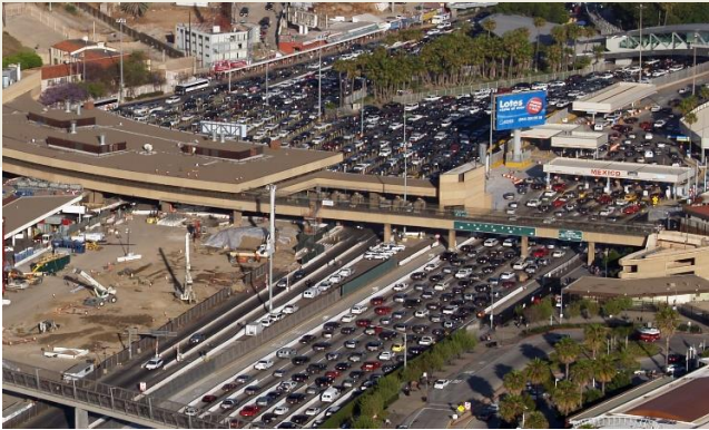
SAN YSIDRO/TIJUANA BORDER