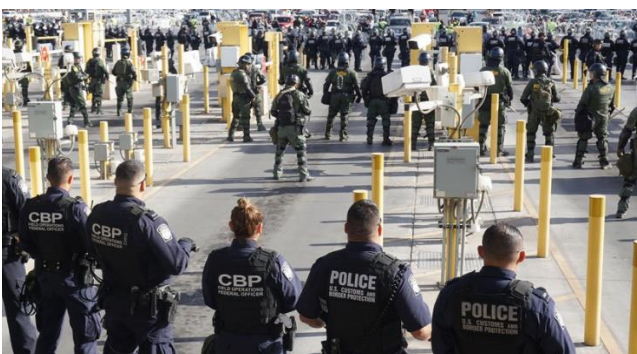
CBP agents performing drills closing the San Ysidro port of entry.

The strong partnership and close cooperation between the United States and Mexico has allowed us to maintain a productive border environment. We evaluate the health and safety of our citizens and keep that at the forefront of joint decisions made by our respective leaders regarding cross-border operations. Recognizing the robust trade relationship between the United States and Mexico, we agree our two countries, in response to the ongoing global and regional health situation, require particular measures both to protect bilateral trade and our countries economies and ensure the health of our nations citizens. We agree to the need for a dedicated joint effort to prevent spread of the COVID-19 virus and address the economic effects resulting from reduced mobility along our shared border. Essential travel must therefore continue unimpeded during this time. In order to ensure that essential travel can continue, both countries are also temporarily restricting all non-essential travel across its borders. Non-essential travel includes travel that is considered tourism or recreation in nature. Additionally, we are encouraging people to exercise caution by avoiding unnecessary contact with others.